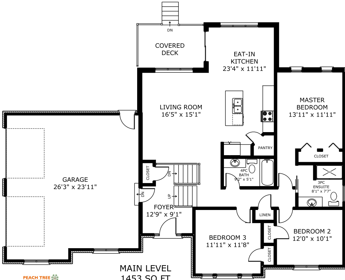
MAIN LEVEL 1453 SQ.FT